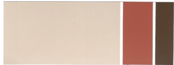
(R) (T) (A)